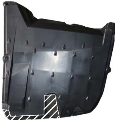
TRIM UNDERBODY PANEL TRIM DIAGRAM