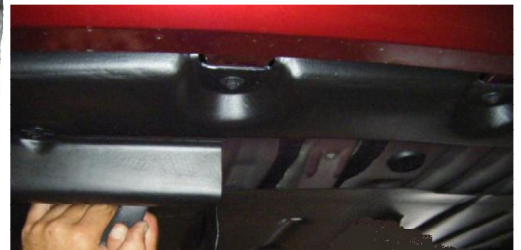
UNDERBODY TRIM DIAGRAM 2