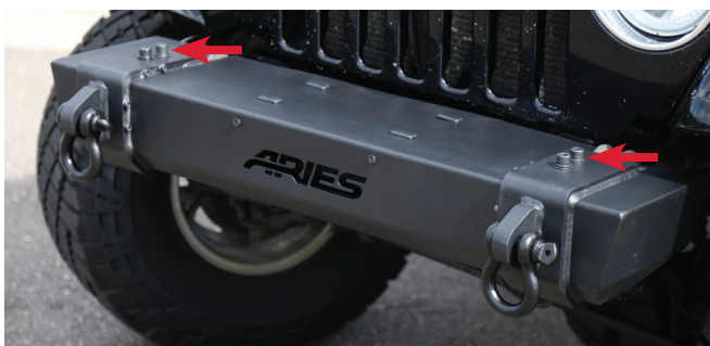
1/2 - 13" x 3.5" screw

See ariesautomotive.com for all accessory options.