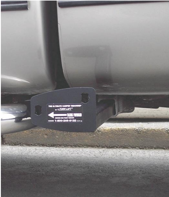
DRIVERS SIDE FRONT

On one end of each of your tie down inserts is a triangular plate referred to by Torklift as a bullet plate. In most cases, the tie down inserts should be installed with the shorter side of the bullet plate facing away from each other (The shorter side of the front insert should point to the front of the truck and the shorter side of the rear insert should point towards the rear of the truck).