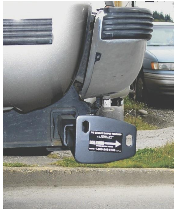
DRIVERS SIDE REAR

Once installed, attach the TorkLift directional stickers to the face of the bullet plate on the insert as a reminder.