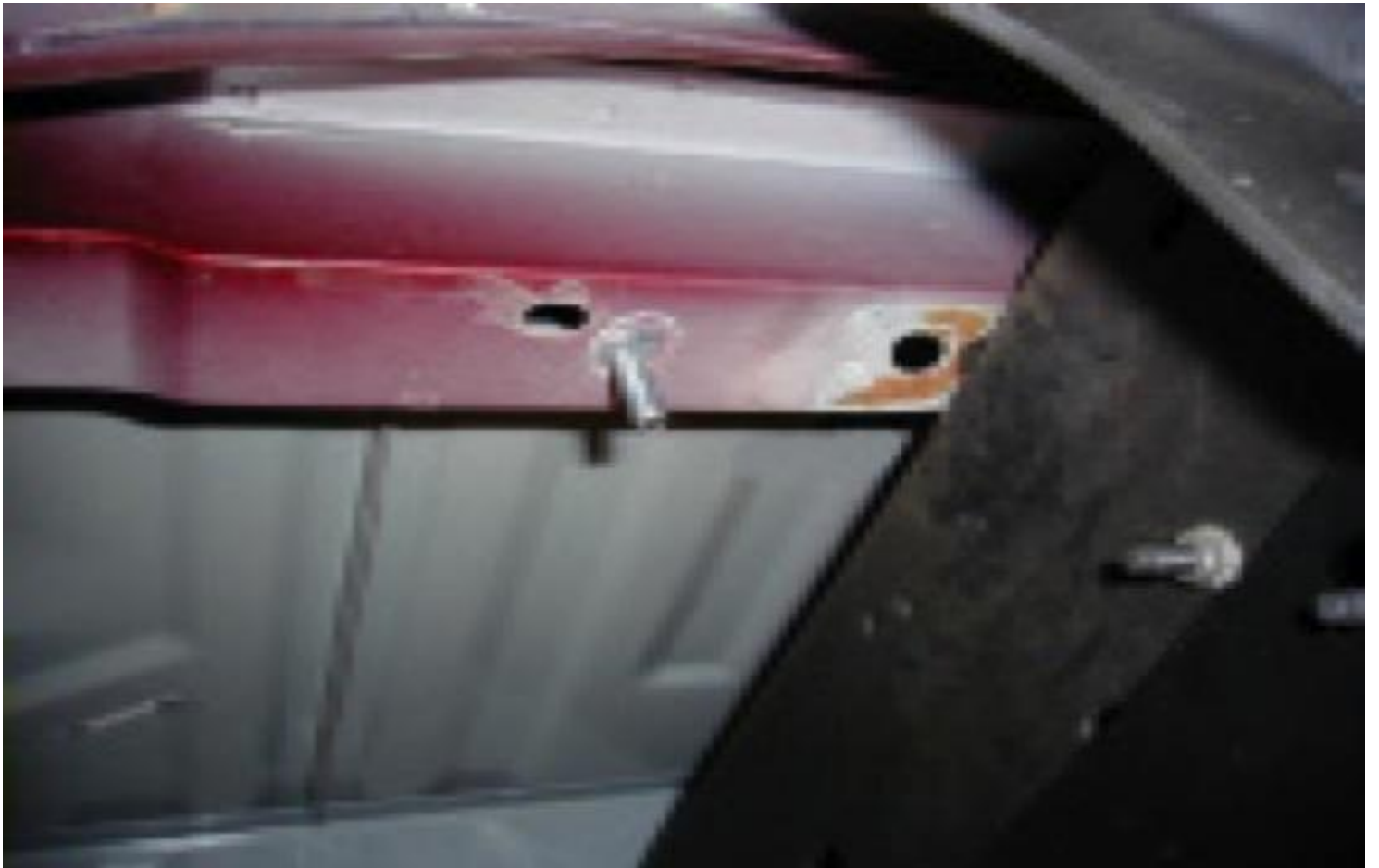
UPPER CHANNEL WITH BOLT IN PLACE FOR UPPER SUPPORT CHANNEL