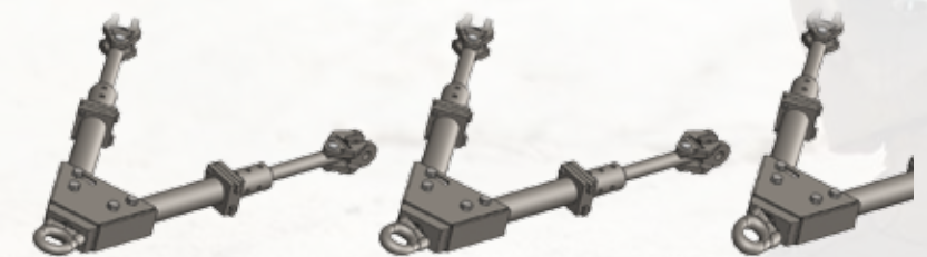
Illustration of Blue Ox® swivel pintle connection