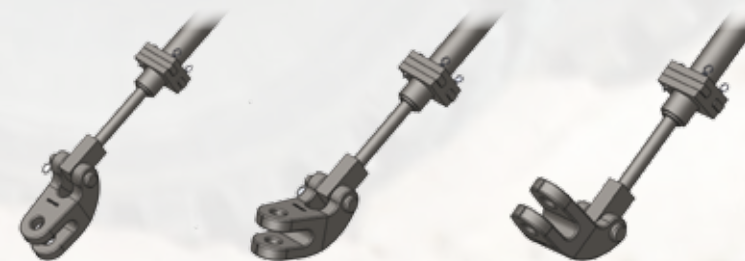
Illustration of swivel lug connection

A Blue Ox® swivel pintle and clevis makes a huge difference in hook-up time and ease of operation — on and off the road. These illustrations show how much range of motion these quality Blue Ox® products have during the coupling process.